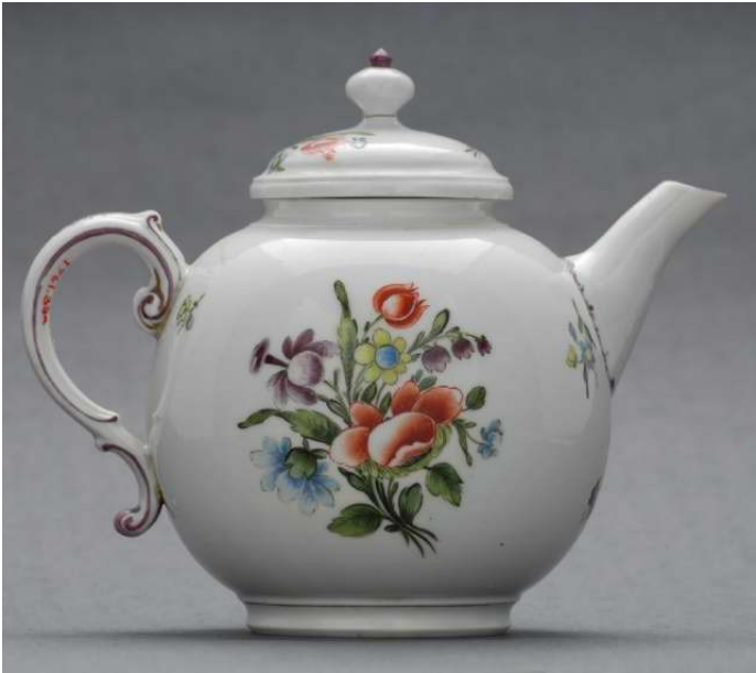
Porcelain teapot, Dresden, Germany, ca. 1900. Nichols House Museum, 1961.33.