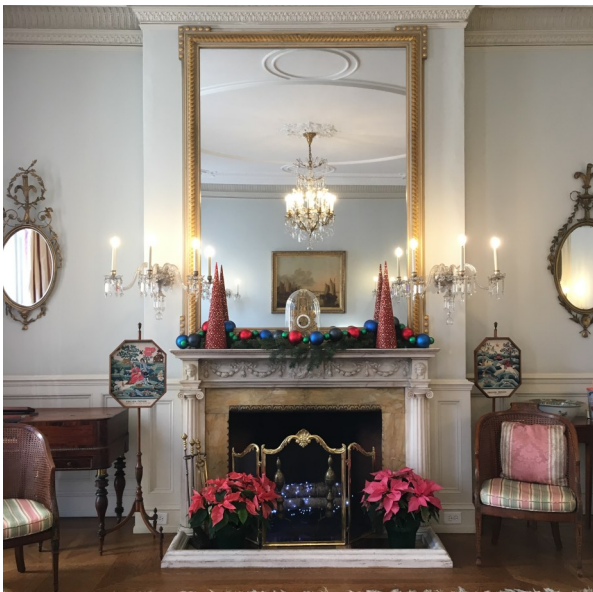
The reception for the Beacon Hill Holiday House Tour was held at the Prescott House on Beacon Street.