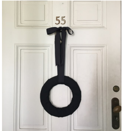
Dearly Departed: Death and Dying in 19th Century Boston featured costume items on loan from the National Society of the Colonial Dames of America. The Museum was put into mourning for this Nichols after Dark event.