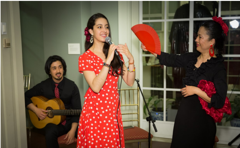
Performers from Flamenco Boston