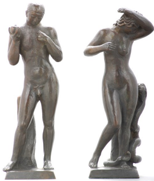
Paul Manship (American, 1885 -1966), Adam and Eve , ca. 1922. Bronze. Nichols House Museum, 1961.344.1-2.