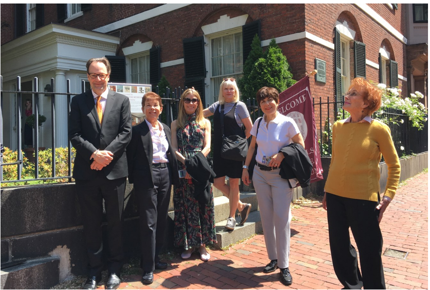
A patron group from the de Young Museum in San Francisco, California toured the Nichols House Museum in June 2018.

This Holiday season, our pint-sized friends at the Commonwealth Children's Center helped us decorate by answering the question "What is a Museum?"