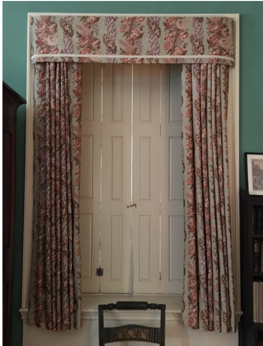
Reproduced curtains installed in Rose Nichols' bedroom.