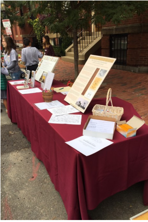
Above: The Nichols House Museum's booth at Fall Fun Fest hosted by the Beacon Hill Civic Association.