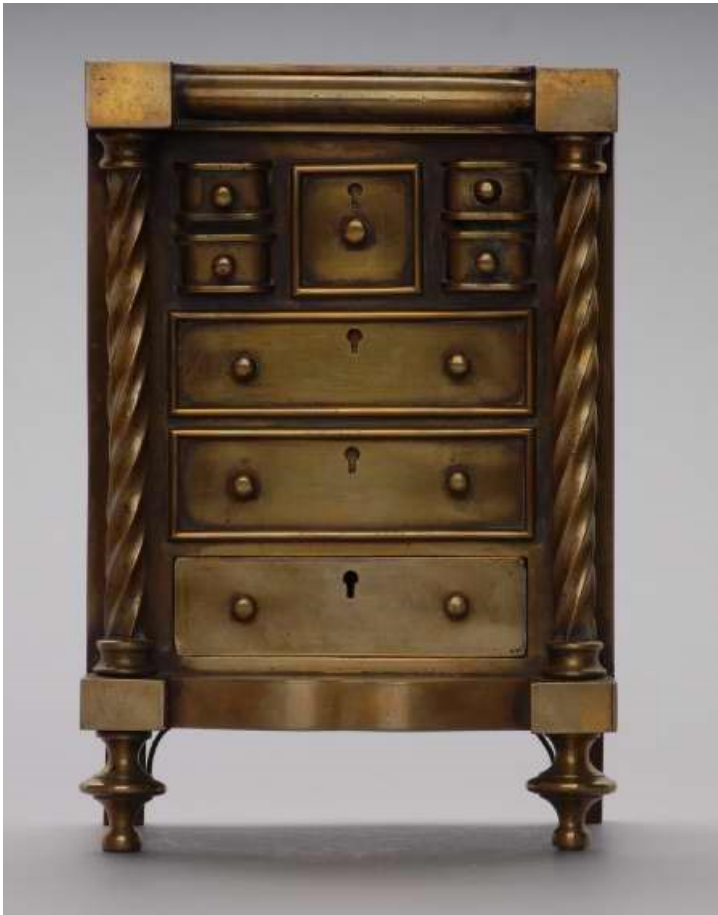
Cigar canister or matchbox, English, nineteenth century. Subject of blog post "Close, But No Cigar" by researcher, Rosemary Foy. July 5, 2018.