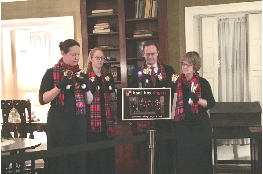
The Back Bay Ringers performed seasonal songs during the Beacon Hill Holiday House Tour at the Museum, December 9th, 2018.