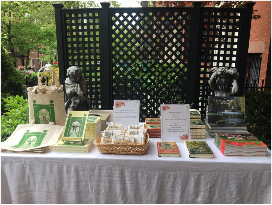
Above: In May 2018, the Nichols House Museum held an open house in conjunction with the Beacon Hill Garden Tour hosted by the Beacon Hill Garden Club.